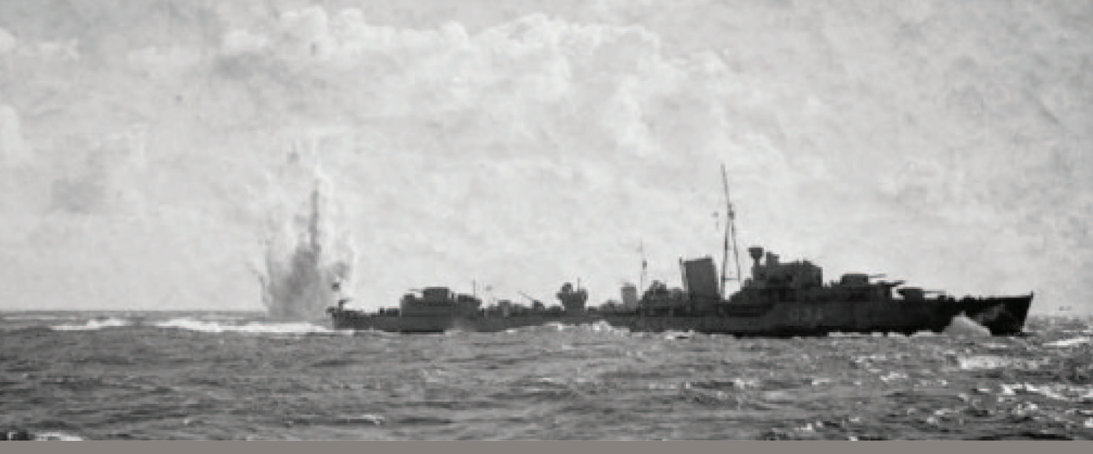
HMS Jaguar, a British Destroyer at sea in the Mediterranean circa 1941, with an explosion behind her bow (depth charge). During Operation Abstention, HMS Jaguar "swung into the mouth of Megisti harbour. It executed a 'hit and run' attack on the Italians. Perhaps not wishing to get entwined in a shooting match in the confined area of the harbor, the Jaguar fired all four torpedoes from the mouth of the Kastellorizo port and fled. All missed the Italian Navy MAS patrol boats docked in the harbour and slammed harmlessly into the shore"(9).